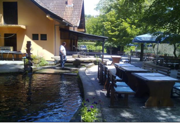
Garden-restaurant in the,, PECINA" complex