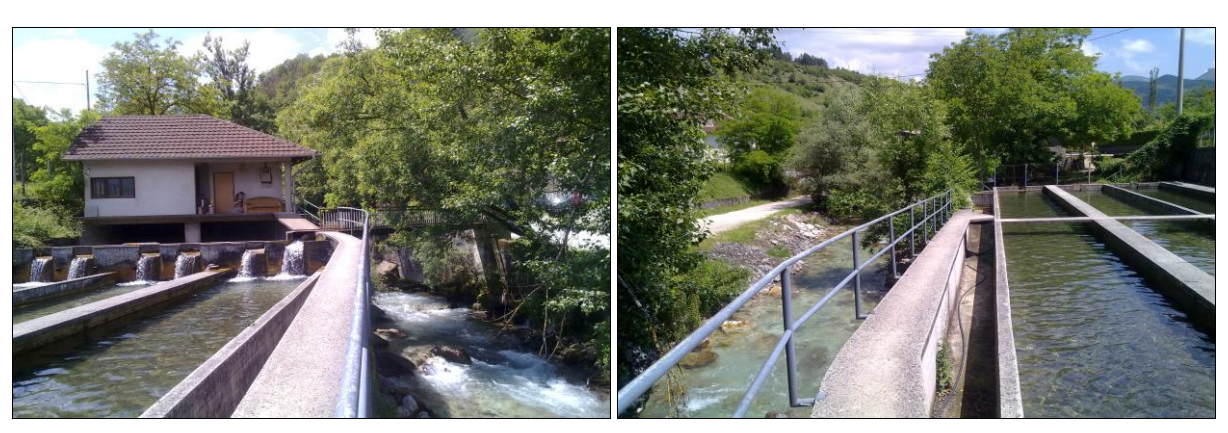
The fishpond in the,, PECINA" complex