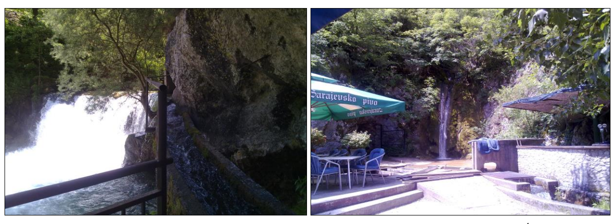
Redirecting part of the Baščica river flow to the "PECINA" ("CAVE") complex (left) and the waterfall in the "PEĆINA" complex (springs from the rock, on the left side of the Bascica river), (right)