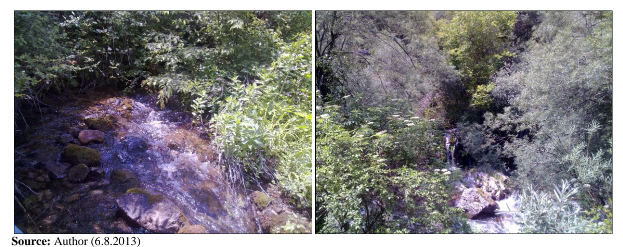
Fig 7: The 'Barica' sourceis about 50 m from the Bascica river flow, on the left side of the flow (left) and the mouth of the Barica river into the Bascica river (right)