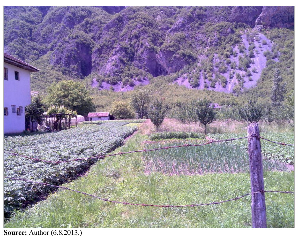
Fig 11: The Idbar village developed in the fertile valley of the Bascica river

Boundaries are those places in the environment where the situations encountered are controlled according to very specific human needs. Conditions are all those discovered and undiscovered phenomena in space that have a stimulating or degrading effect on humans. Borders, therefore, have the task of enabling the selection of influences. In an architectural sense, they enclose, but also include a person in the conditions of a certain environment [4] (Fig 11-14).