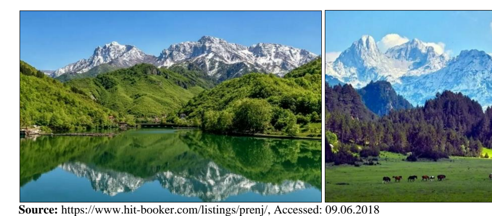
Fig 2: Prenj Mountain

In the valley there are settlements (one of them is the village of Idbar) with fertile fields where cereals, fruits and vegetables are grown. In the summer part of the year, numerous flocks of sheep grazed on the spacious pastures of Prenja (and produced dairy products and wool). Visoki Prenj is an efficient 'catcher' of rain and snow that ensures the abundance of many springs (and the river Baščica) throughout the year. The highest peak of Prenje, Zelena glava, is at an altitude of 2155 m (Fig 2-7).