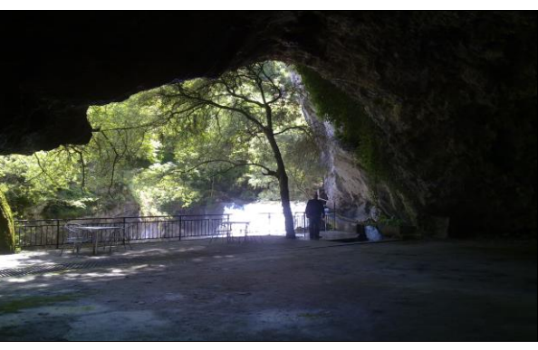
A natural cave along the Bascica river (left) and a view from the cave of the Bascice waterfall (right)