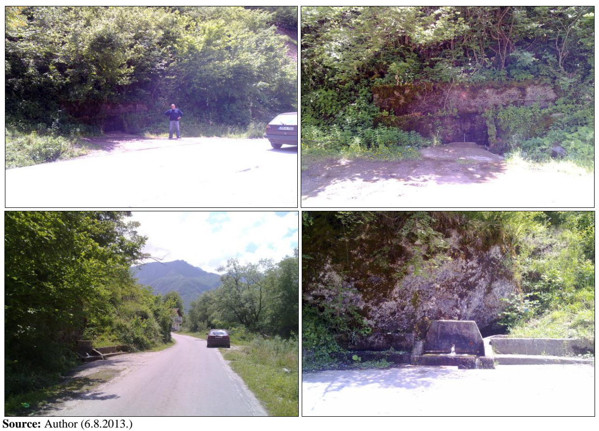
Fig 5: A greater number of public fountains along the Celebici-Idbar road