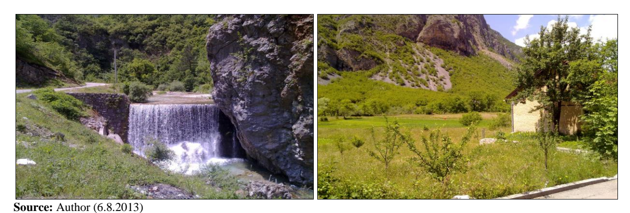
Fig 3: Bascica River and its valley