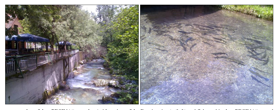
The restaurant garden of the "PECINA" complex (with a view of the Bascica river), (left) and fishpond in the "PECINA" complex (right)