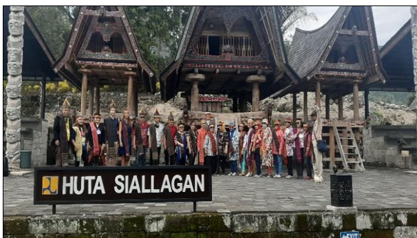
Pic 3a: Cultural Activities in Tuktuk

Both Tuktuk and Pangururan offer unique lodging experiences for tourists visiting Samosir Island. The choice of accommodation depends on personal preferences, with Tuktuk suitable for those seeking bustling activity and easy access to facilities, while Pangururan is suitable for those who want to enjoy tranquility and the natural beauty of Samosir Island more exclusively.