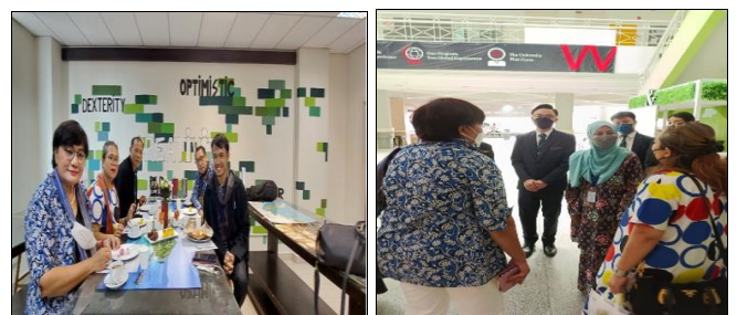
Pic 5: Discussion Held at UOW Malaysia KDU Penang University College

Always adhere to safety regulations and the scheduled departure of transportation. Prepare a map or digital navigation to help you navigate your journey route.