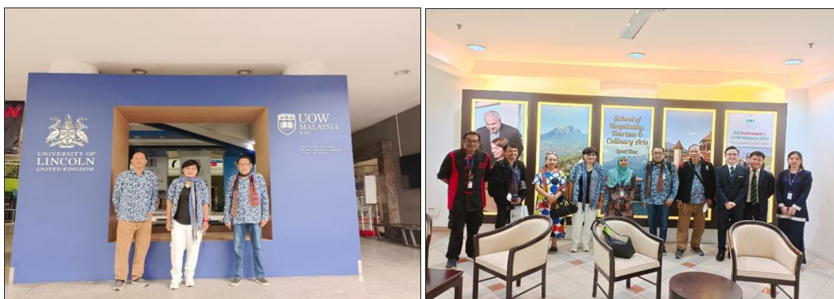
Pic 1: Arrival at UOW Malaysia KDU Penang University College

This paper was written using a qualitative method through literature review, documentation, and field observation supplemented with unstructured interviews with informants encountered during the activities (Jamshed, 2014; Abdussamad, 2021) [4,5] .