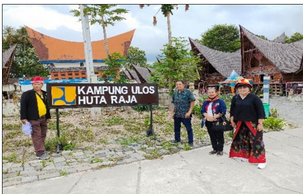
Pic 3b: Cultural Activities in Pangururan