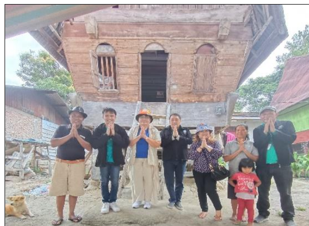
Pic 2b: With the Community at Lake Toba

Meanwhile, midsentris tourists have tendencies between the two previous types. Various activities provided at Lake Toba can meet the needs and interests of these three types of tourists. In a primary survey, some activities suitable for each type of tourist include the following [8, 9] .