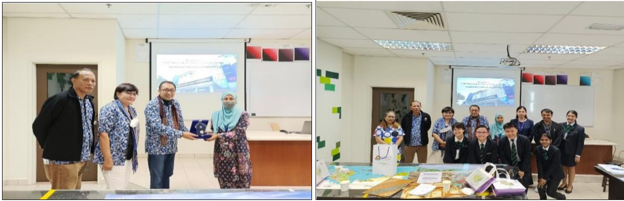
Pic 6: Souvenir Exchange with UOW Malaysia KDU Penang University College