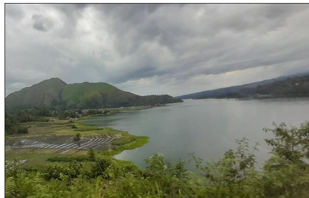
Pic 2a: Lake Toba

adventures, while psychocentric tourists prefer to return to destinations they are already familiar with and relax more.